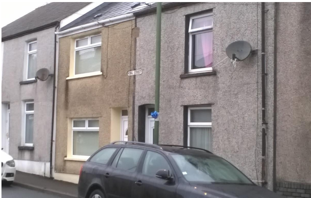
Contemporary picture showing King Street & its street name plate, above is a name plate that says: “Prince’s Place”

the early 1800s this area of Waun-y-Helygen was one of small farm dwellings which would soon become a town of significant size to be named Brynmawr. 3 Hence what had in the eighteenth century been the small community of Waun- y- Helegyn exploded in the nineteenth into the thriving industrial town of Brynmawr due to the development nearby of ironworks at Nantyglo, Clydach and Beaufort. The Prince of Wales Inn was still going strong in 1859 and recorded as being in King Street, Brynmawr. 4 King Street survives to this day as does the building formally the Prince of Wales Public House and some of its outbuildings currently known as 37 and 38 King Street.